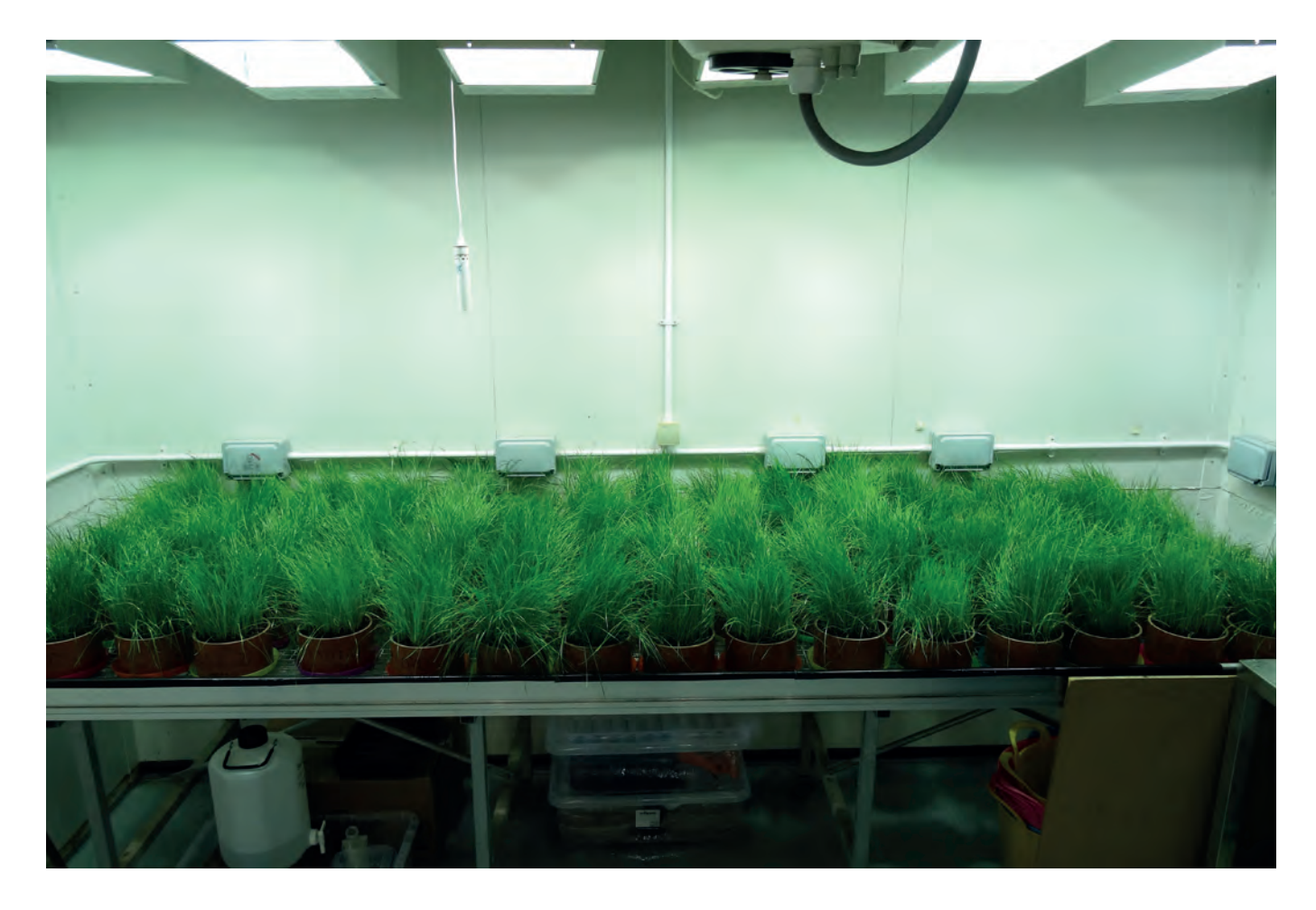
FIGURE 2 Legacy P trial conducted at Lancaster Environment Centre.